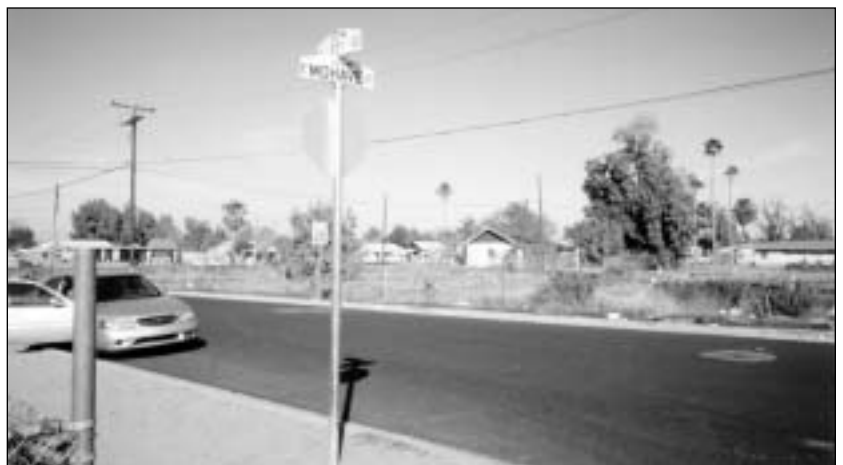
Pictured is Don's large vacant lot property on 11th St. and Mohave.