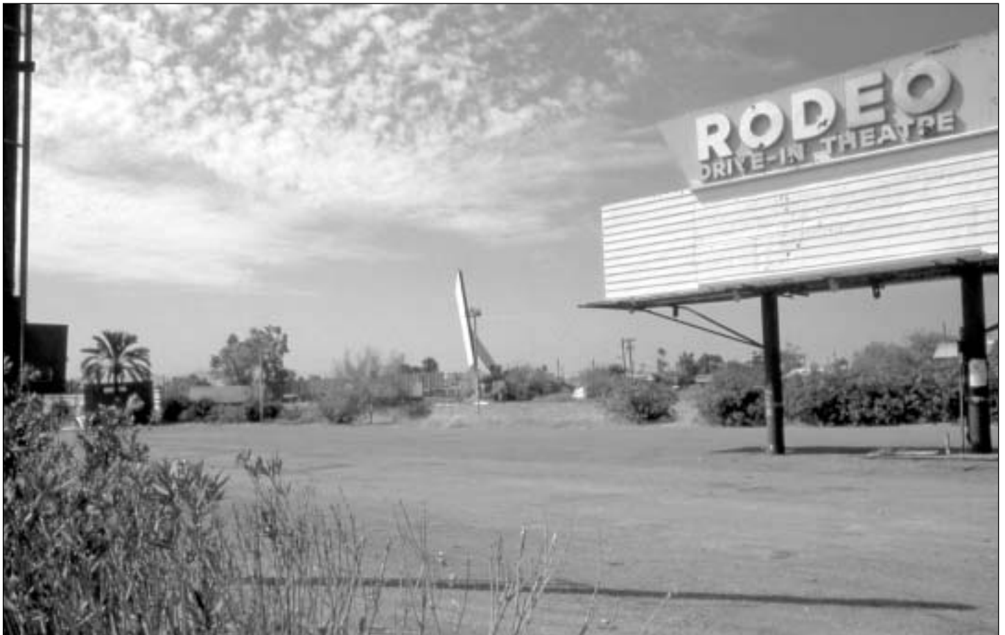
"The Rodeo Drive-In was situated in the middle of the neighborhood where residents could actually watch movies from their yards and rooftops."