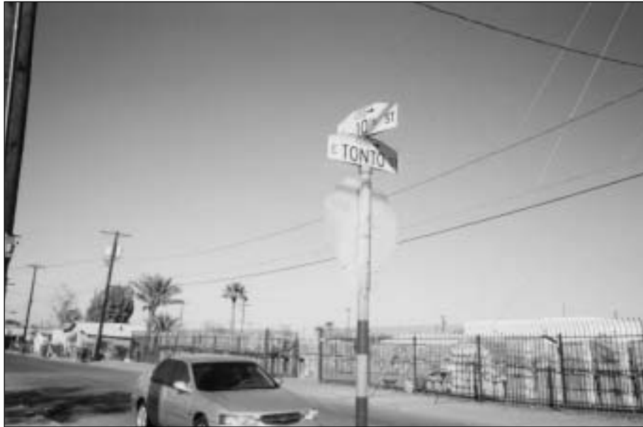
10th St. and Tonto St. - Former site of an old, popular neighborhood tavern, the “Hollywood Bar” in the Campito neighborhood.

And Freddy has also witnessed the tearing down of many neighborhood structures “...knocking all